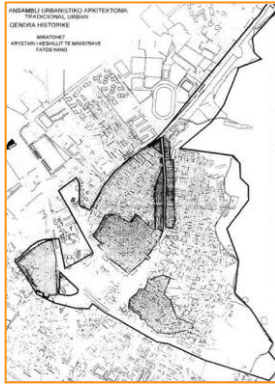
Picture 1: The “Historic Centre” and the “Ensemble of Traditional Urbanism, Architecture” according to the Law 455/23-6-2005 49