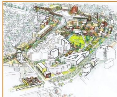
Pictures 6 & 7: Design proposal for the Historic Centre of Korça by Bolles+Wilson (Masterplan Korça City Centre) 53